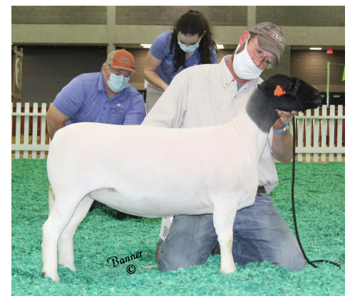
RF 6933 - Champion Dorper Ewe 2020 NAILE. SHE SELLS AS LOT 69!

These yearling ewes are a flat incredible group. Super uniform, feminine fronted, long bodied with thickness. Some are better than others, but from top to bottom they are very similar.