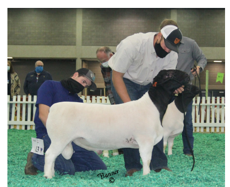
RF 6945 - Grand Champion Ram 2020 NAILE. He sells as Lot 5!

Champion Ram 2020 NAILE. What a ram!! Ewes sell exposed to him for fall lambs. Sired by Lot 1 and dammed by a super ewe 6395 lot 31. 6395 dammed our Reserve Champion Ewe at the 2019 NAILE. 6945 is the best son of 854, he is long, big, good headed and muscular. He traces back to our best genetics 5150, 4930, 4465, Powell Ranch 4473 and the legendary female 4415.