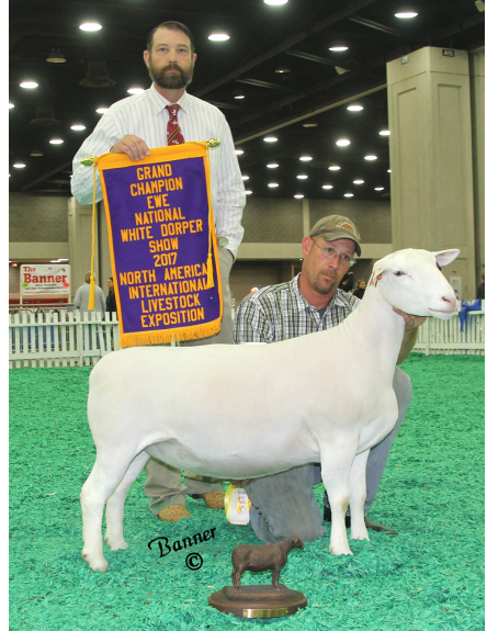
RF 6445 - Grand Champion Ewe 2017 NAILE, Supreme Ewe at 2017 Big E. This stud ewe sells as Lot 150!

When signing up for a Buyers Number... Be sure to sign up the way you want your sheep transferred