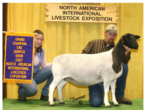
Grand Champion Ewe 2007 NAILE. These winning genetics sell on May 29!

We used frozen semen from 4473 to flush 6905 (Lot 48). Not the best idea but we received one very good ewe lamb. Champion Genetics here! The 4473 daughters are great brood ewes. Dam is Lot 48.