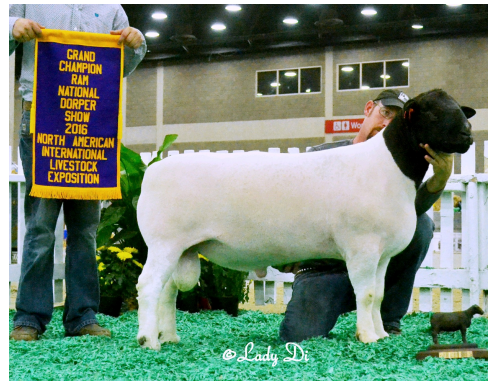
RF 6235 - Grand Champion Ram 2016 NAILE. Sire of Lot 2 and others in the Sale!