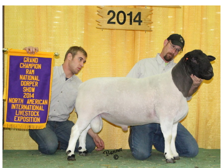
RF 5938 - Grand Champion Ram 2014 NAILE. Sire of Lots 25 & 26.

This girl has a large Black Patch on her hind leg. Another 6235 daughter that did a great job raising her fall buck lamb. The old 1096 ewe has a little genetic power behind her! Mother of Lot 10. Exposed to 6799.